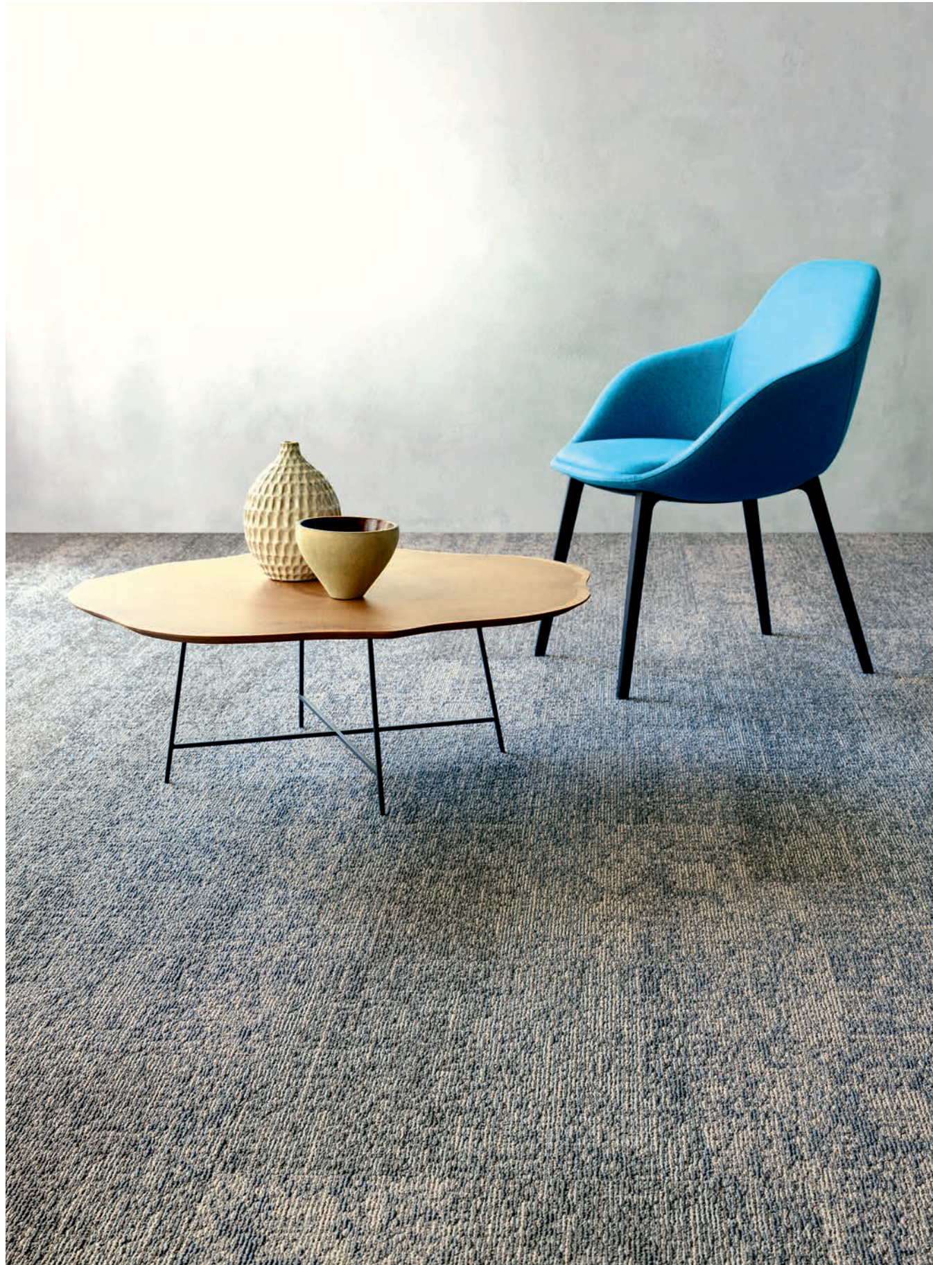
ARRANGE (CARPET TILE 5T294) IN MIRROR GREY (94535) | INSTALLED BRICK