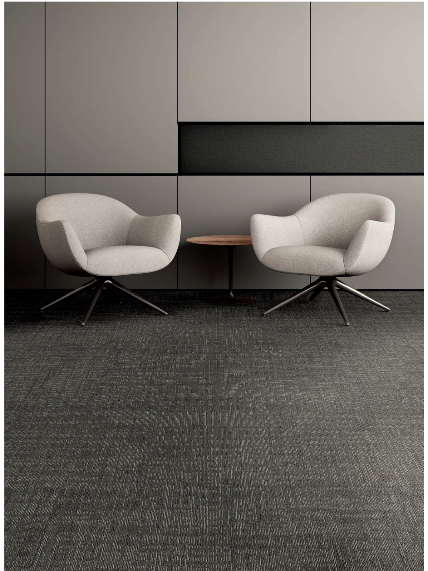
INTENT (CARPET TILE 5T208) IN NOCTURNE 08557 | INSTALLED MONOLITHIC