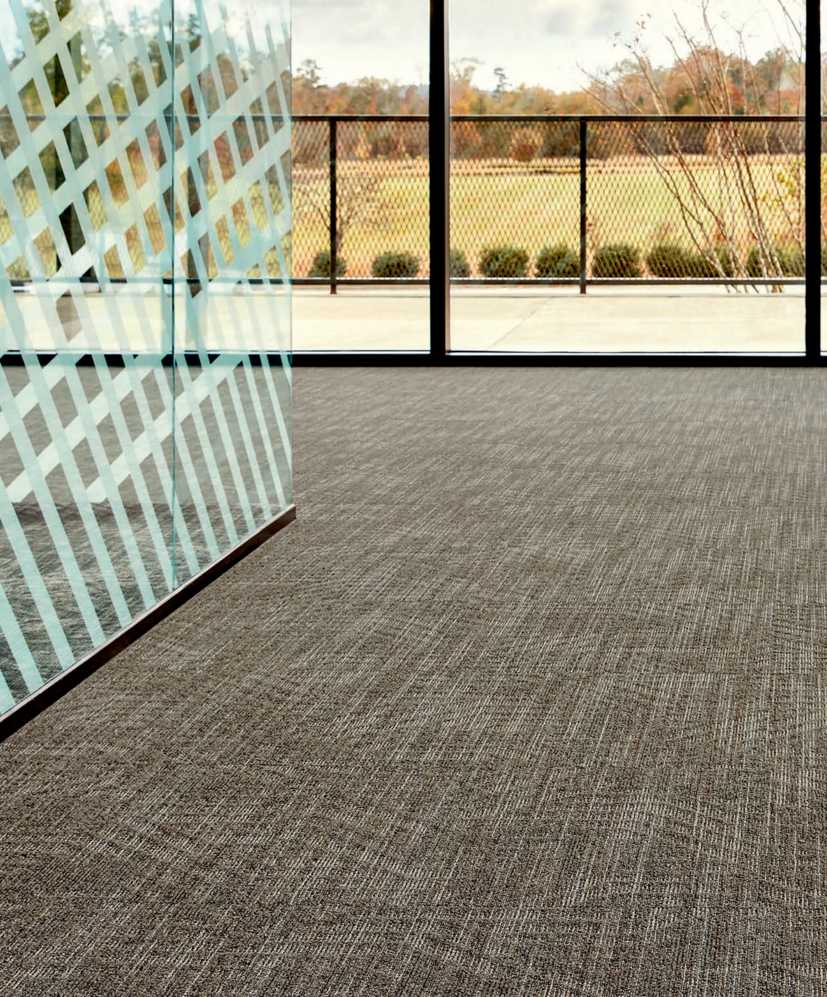
ENERGIZE (CARPET TILE 5T458) IN TEAM (57760) | INSTALLED MONOLITHIC