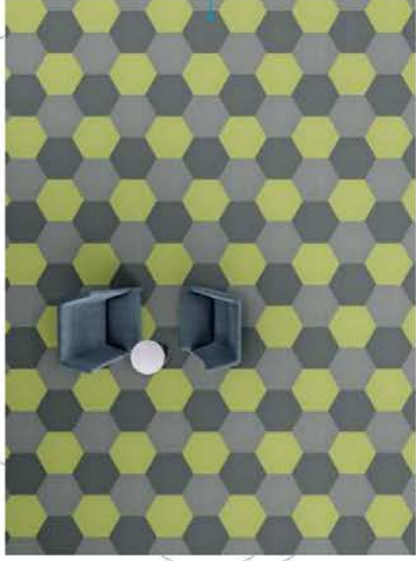
plane in tweed + pewter + citron