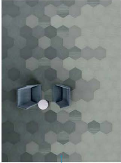
plane in tweed + pewter linear in tweed + pewter linear shift in pewter tweed