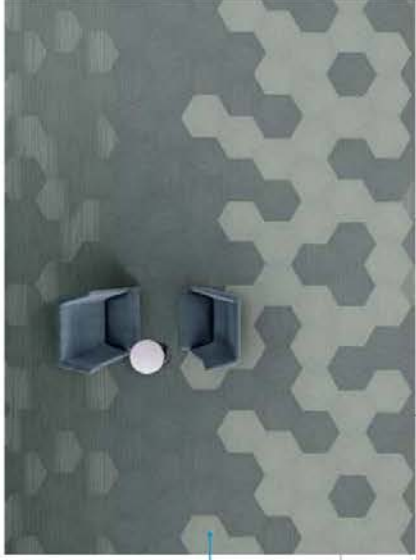
linear in tweed + pewter linear shift in pewter tweed