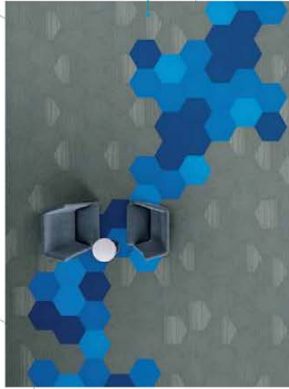
plane in royal + wave + cyan linear in tweed linear shift in pewter tweed

How will you network Hexagon? We have an interactive tool for that. Start visualizing here, then go online to construct your own interconnected installations at shawcontractgroup.com . Social hives now forming.