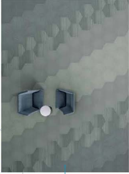
plane in tweed + pewter linear in tweed + pewter linear shift in pewter tweed