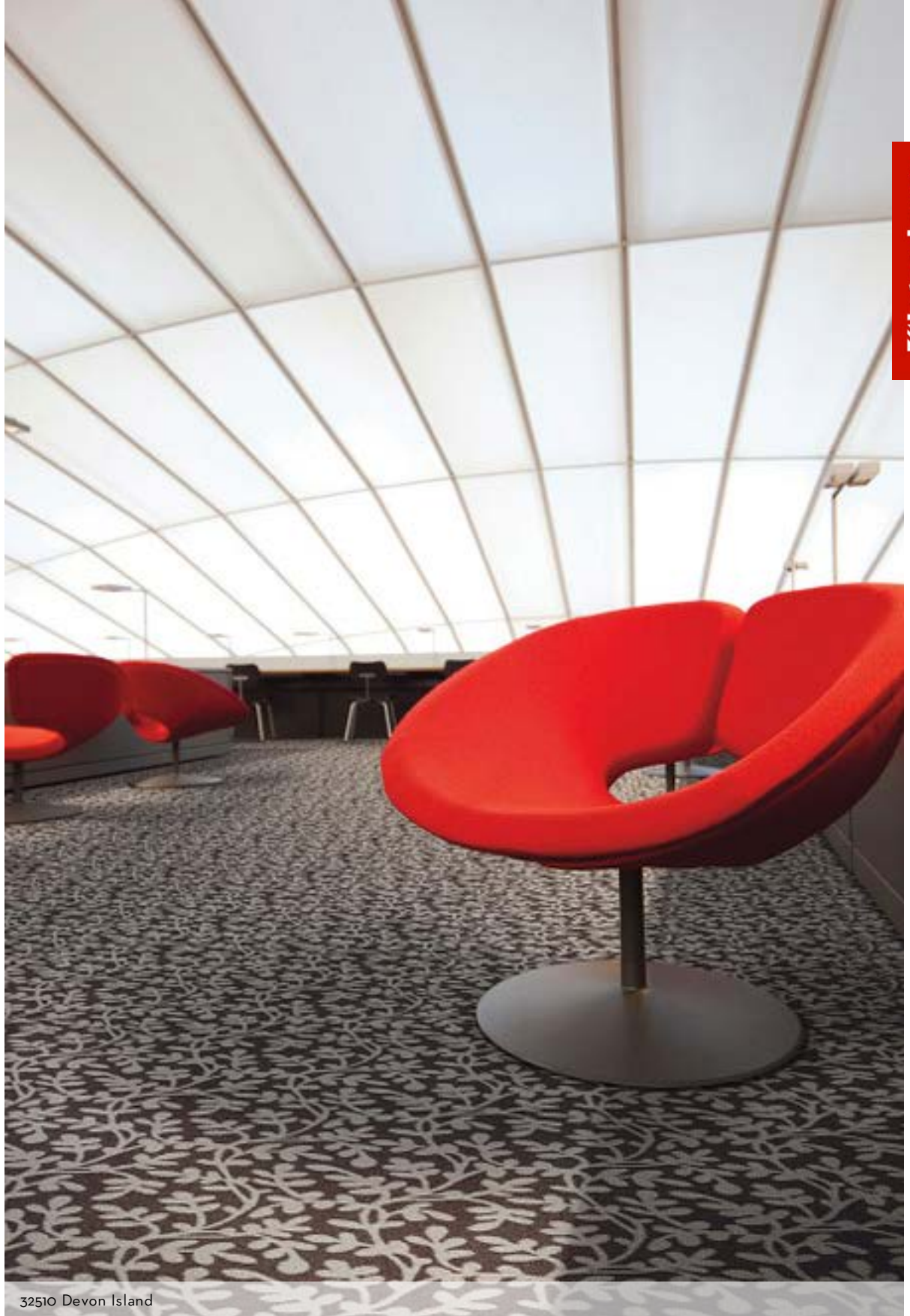
32510 Devon Island