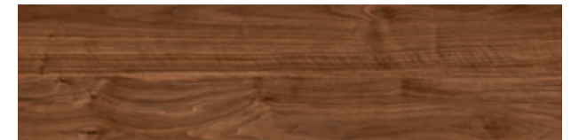
A05015 STAINED MAPLE