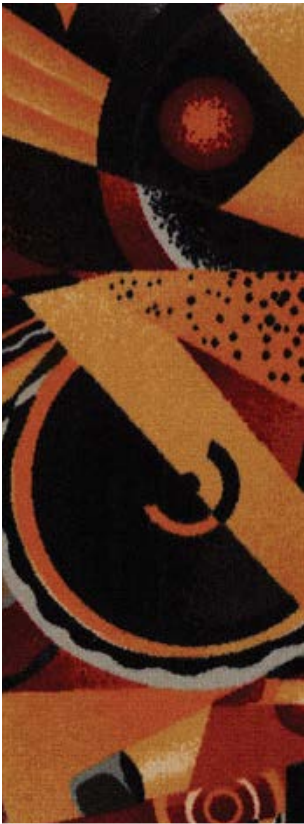
94510 Hocus Pocus