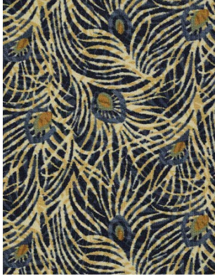
30400 Sri Lanka