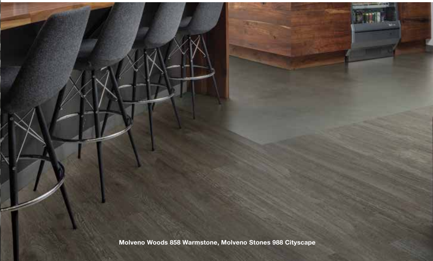
Molveno Woods 858 Warmstone, Molveno Stones 988 Cityscape