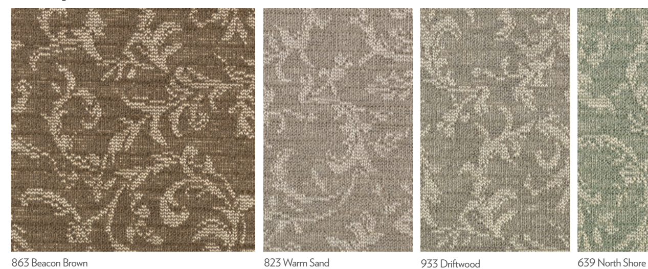
863 Beacon Brown