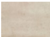
258 Viva Gold Quickship Available