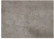
859 On The Line Quickship Available