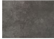
959 So Fetch Quickship Available