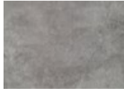
929 Proper Gray Quickship Available