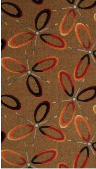
4200 Brass Ring