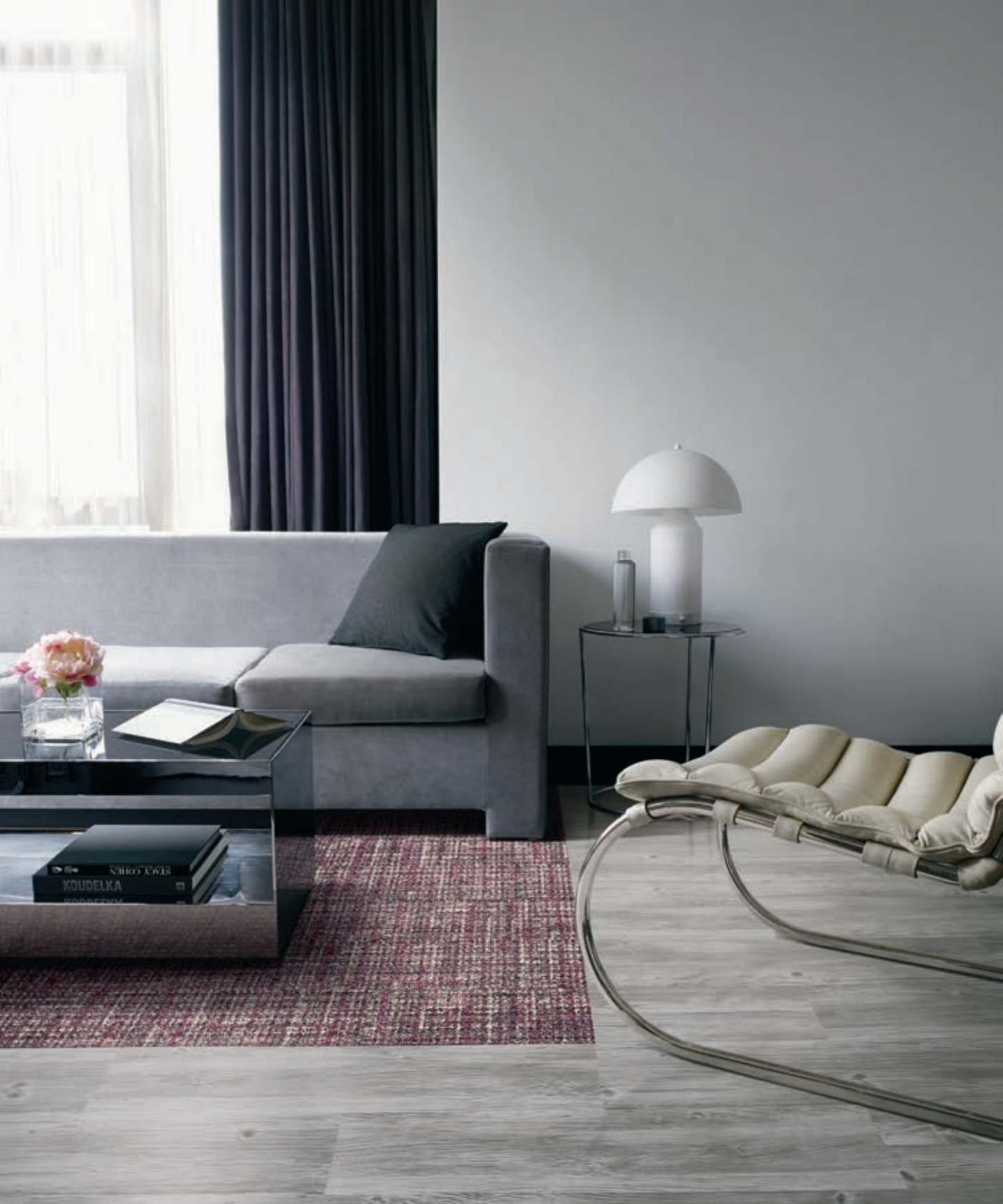
LVT PRODUCT NATURAL WOODGRAINS COLOR A00206 WINTER GREY CARPET PRODUCT WORLD WOVEN | WW895 COLOR 105379 FUCHSIA WEAVE INSTALLED ASHLAR