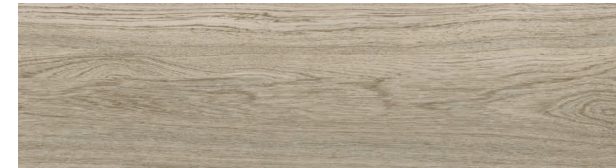
A00207 WASHED WHEAT