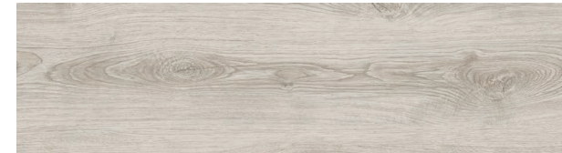
A00208 SAND DUNE