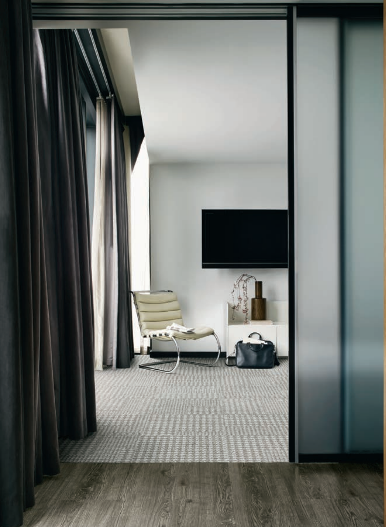
LVT PRODUCT NATURAL WOODGRAINS COLOR A00205 STORM INSTALLED ASHLAR FLOR PRODUCT COLLINS COTTAGE™ COLOR 105413 HOUND LINEN INSTALLED NON DIRECTIONAL