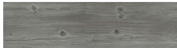
A00206 WINTER GREY