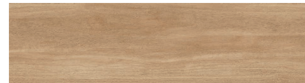
A00211 WASHED MAPLE