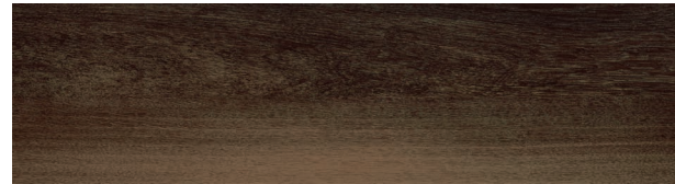
A00201 BLACK WALNUT