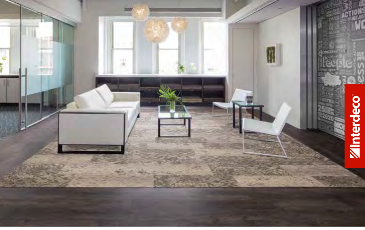
Luxury Vinyl Tile: Global Entry, C0015 Antiek | 931 Nimbus Carpet: Modern Antiquities, MD005 Reborn Wisdom and MD006 Nomadic Wanderer | 849 Taupe