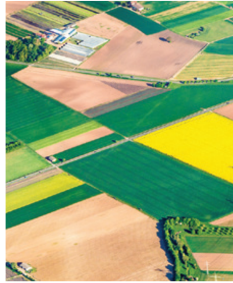
CIAO – creates a contemporary landscape with a mix of large and small blocks