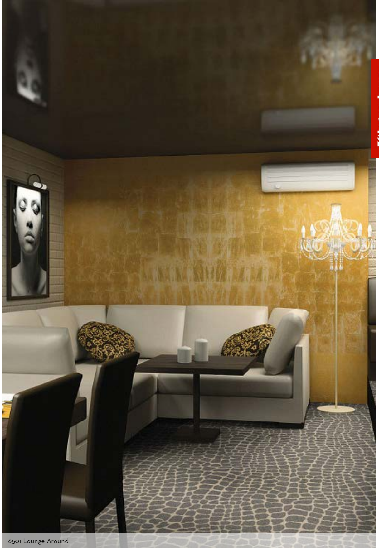
6501 Lounge Around