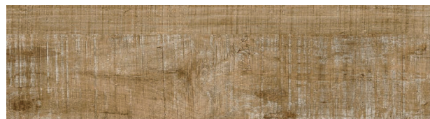
A00403 DISTRESSED HICKORY