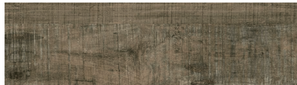
A00401 DISTRESSED WALNUT