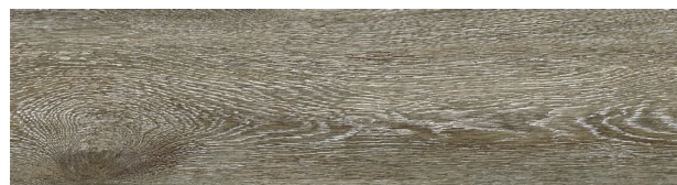
A00405 GREY DUNE