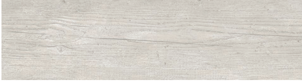
A00407 WHITE WASH