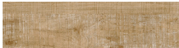
A00402 DISTRESSED CASHEW