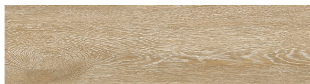
A00406 ANTIQUE LIGHT OAK