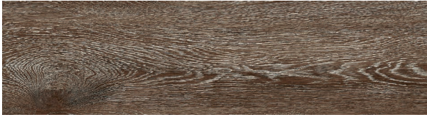
A00408 ANTIQUE GRAY OAK