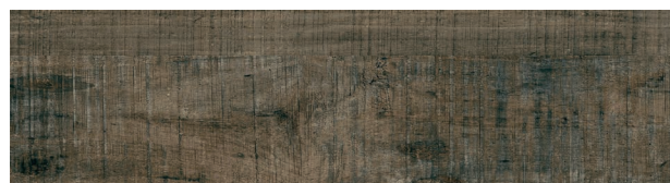
A00404 DISTRESSED BLACK WALNUT