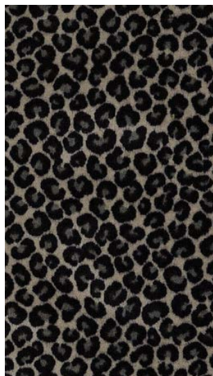
9502 Go Getter