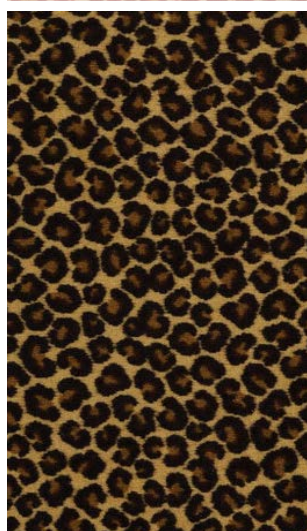
9700 Keep The Pace