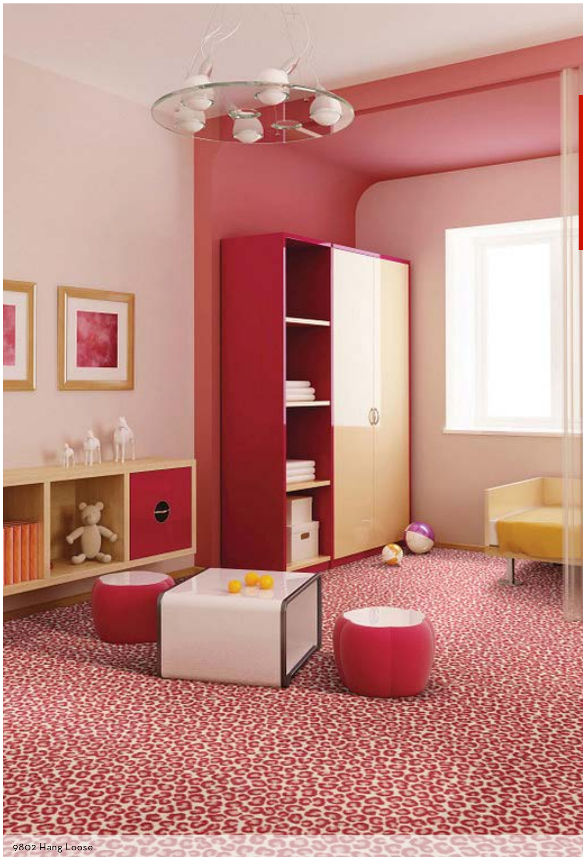
9802 Hang Loose